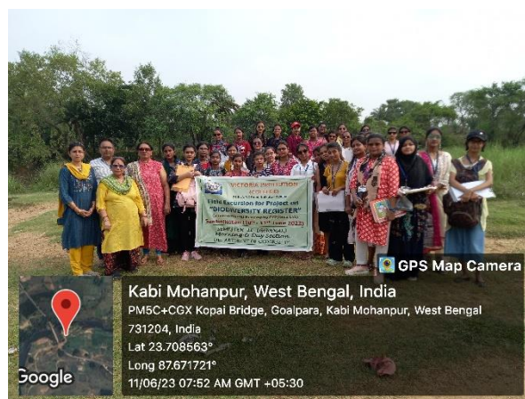
A group photograph of the students and faculties participating in the field excursion