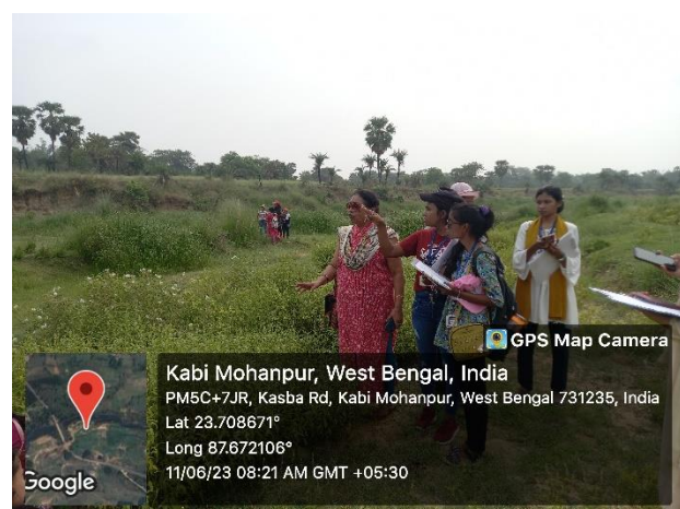
Studying the different floral species during the survey