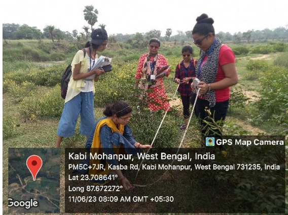
Preparation of plot during the Bio diversity survey